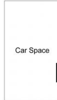
Car Space (Not In Position)